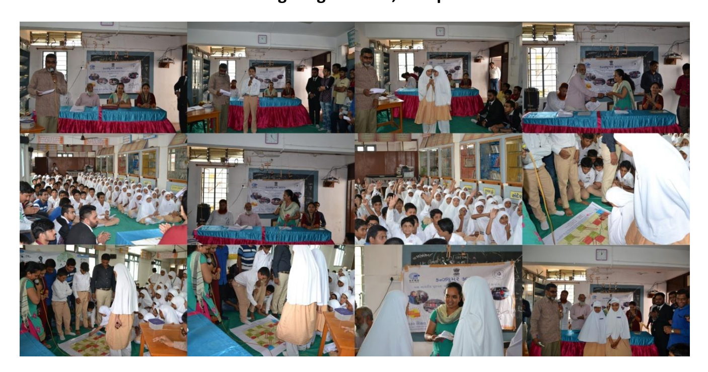
Farooq - e - Azam School, Juhapura